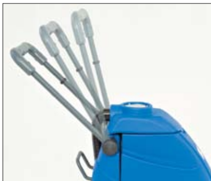
Fold down handle for easy storage and transportation.