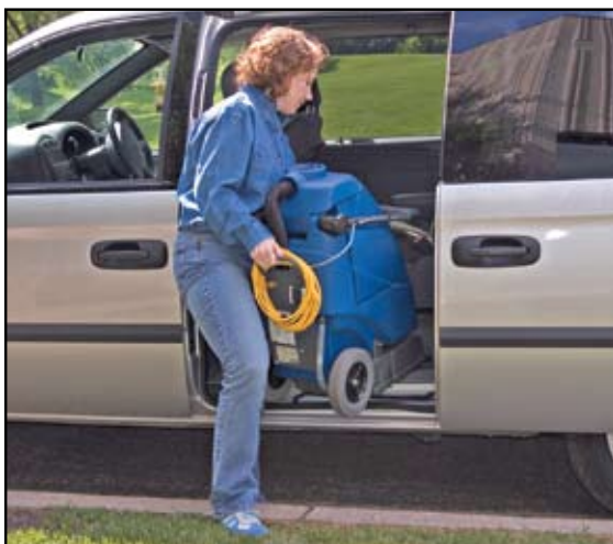
Hand grips and compact folding simplify easy lifting and transport.